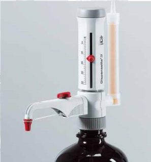
Dispensing sensitive reagents