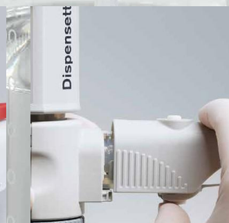
Simple-to-mount discharge tube