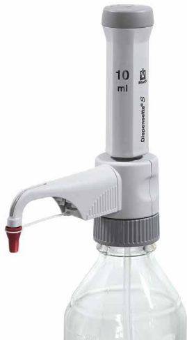
Dispensette® S, Fixed-volume

The bottle-top dispenser Dispensette® S has all the features that make dispensing easy, safe and efficient. Innovative ideas – trusted technology.