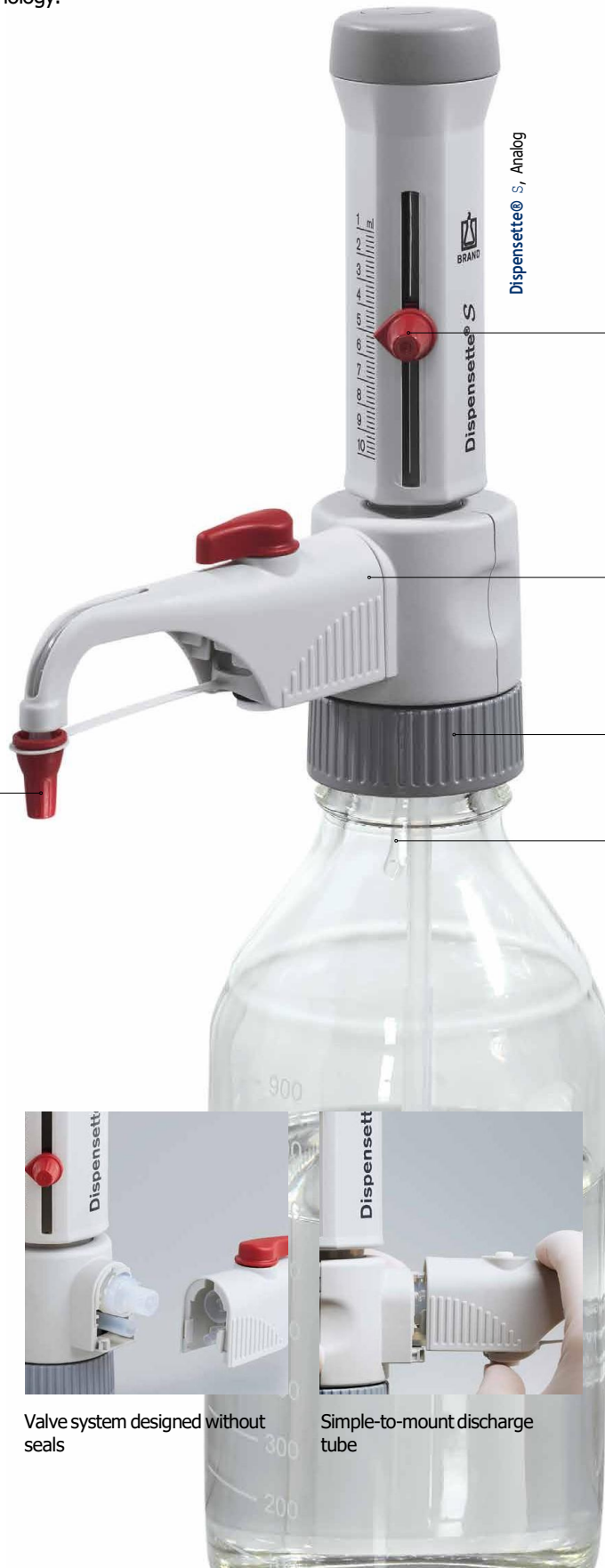
Dispensette® S, Analog

Volume selection with interior scalloped track