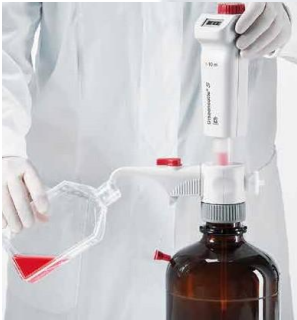
Dispensing sterile fluids