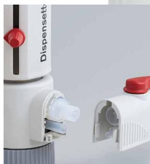
Valve system designed without seals