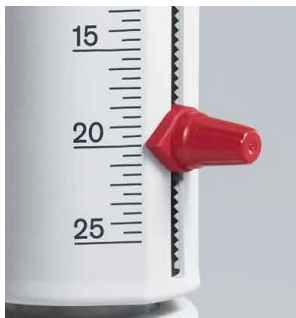
Positive volume setting using interior scalloped track

Hinged screw cap doesn't get in the way when dispensing