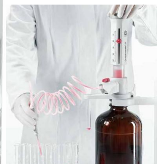
Accessories for serial dispensing