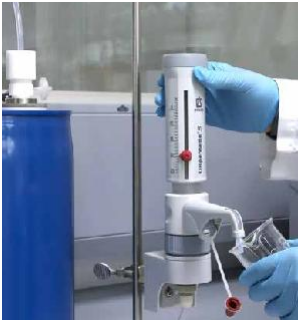
Remote Dispensing System for Drum Dispensing