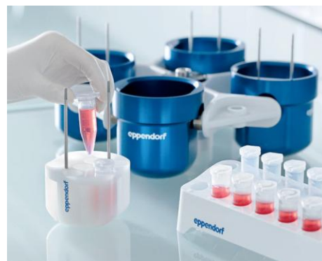
Optimized adapters for existing swing-bucket and fixed-angle rotors