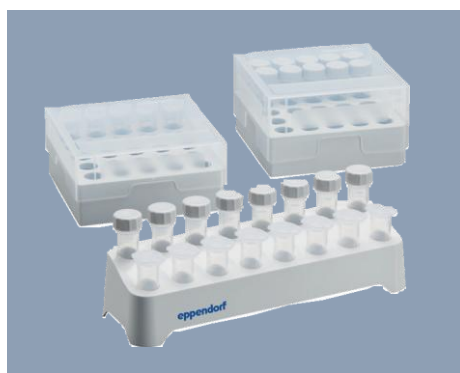
The ideal solution for sample preparation and storage: new racks and storage boxes