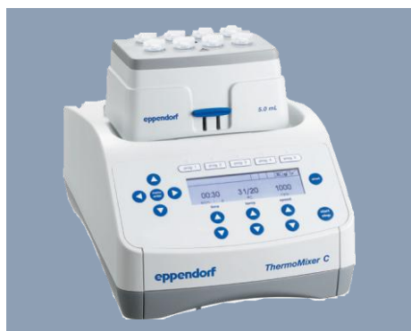
Perfect mixing, heating and cooling with the ThermoMixer C