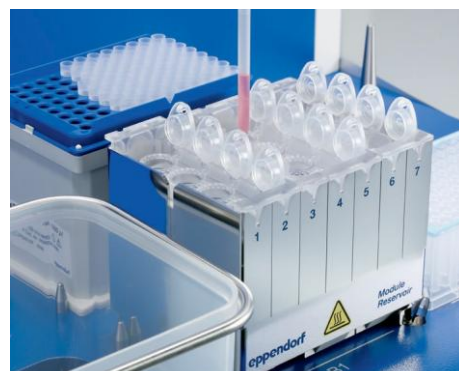
Easy integration in the epMotion automated pipetting system