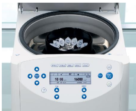
Safe centrifugation with Eppendorf Centrifuges