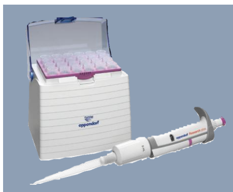
Precise one-step pipetting with Eppendorf pipettes and epT.I.P.S.® 5.0 mL